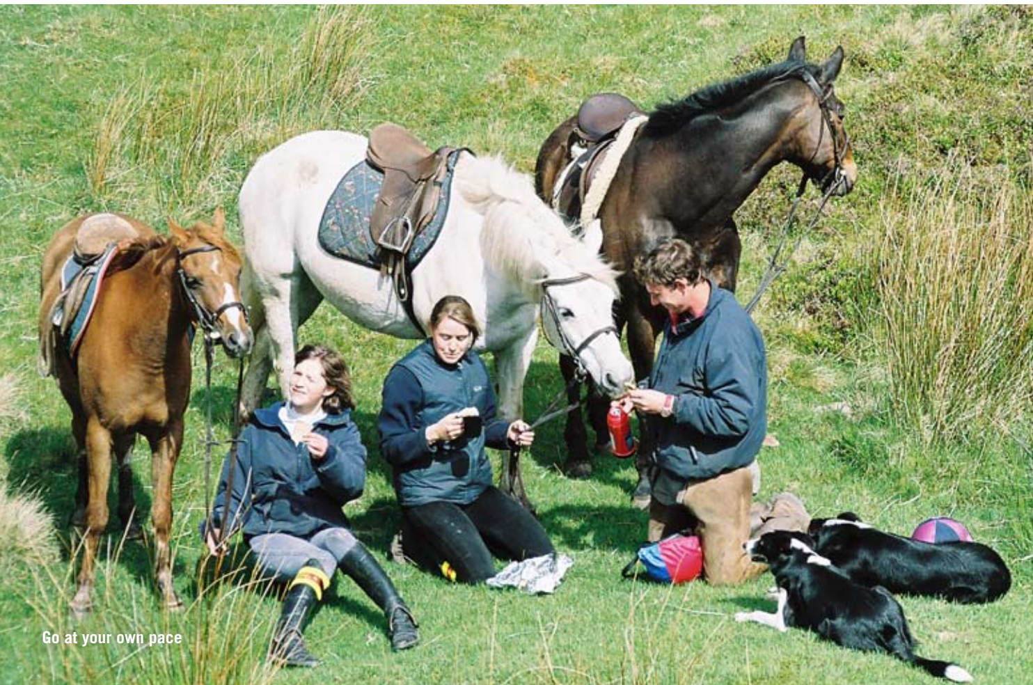
Go at your own pace