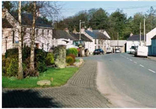
Donard was settled in Neolithic times

Proceed eastwards through Dunlavin. Although you will see a marker for Donard once out of the village, take the safer R412, turning left when you reach the N81. Follow the direction sign marked Blessington until the Donard turnoff to the right.