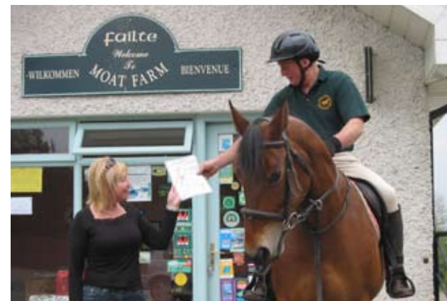
A detailed map of the route on payment